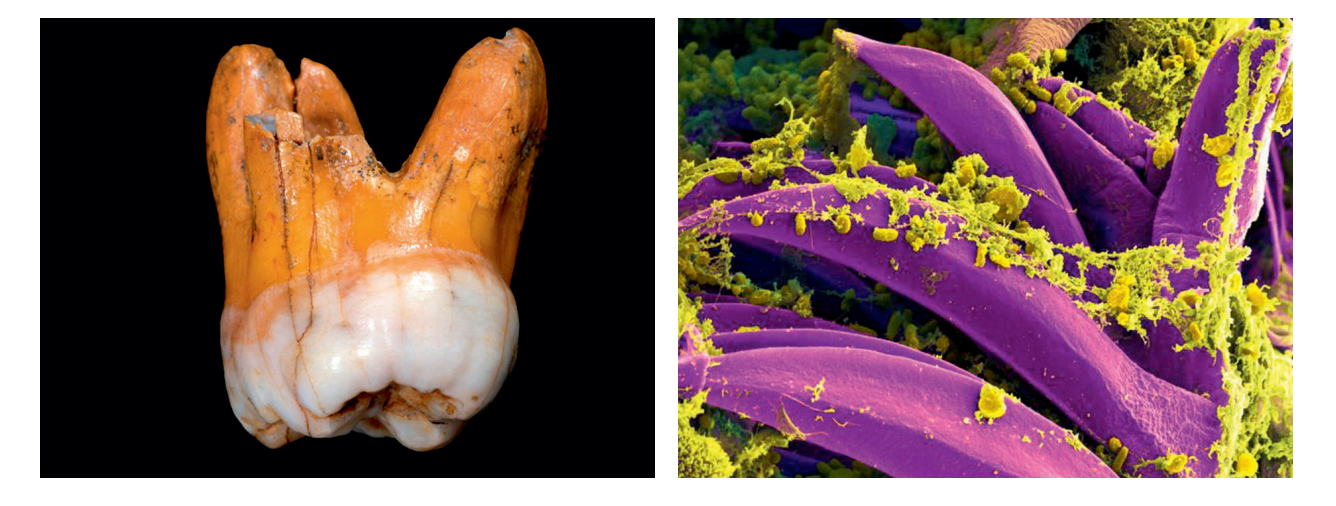
Teeth are the best source of ancient DNA because they still contain traces of dried blood, nerve cells or the genetic fingerprints of ancient germs, such as the pathogen that causes bubonic plague (right).

Reconstructing the entire genome turned out to be extremely challenging. In the end, we succeeded because we always bet on the right horse.